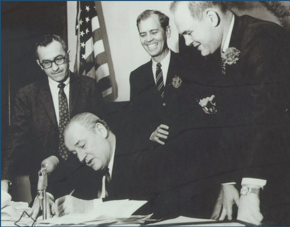
Gov. Winthrop Rockefeller signing the Arkansas Freedom of Information into law on February 14, 1967.