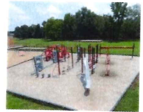
Russellville Sequoyah Russellville, AR