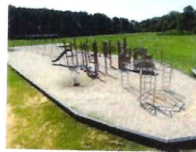
Texarkana College Hill Texarkana, AR