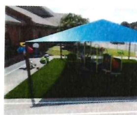
Conway First Presbyterian Conway, AR