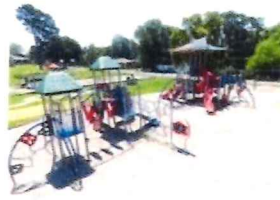
Texarkana Fairview Texarkana, AR