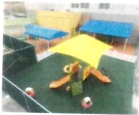
First United Methodist Church Downtown Little Rock, AR