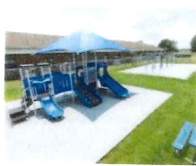
Forest City Central Elementary Forest City, AR