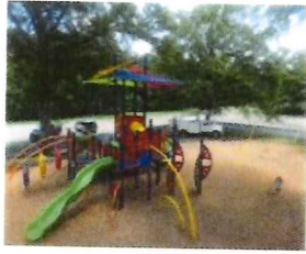
Harrisburg Park Harrisburg, AR