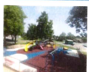
Cabot Inclusive Cabot, AR