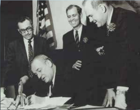
Gov. Winthrop Rockefeller signing the Arkansas Freedom of Information Act into law on February 14, 1967.